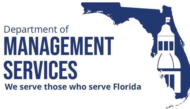
Exhibit B ENTERPRISE STANDARD TERMS AND CONDITIONS

These Enterprise Standard Terms and Conditions set forth the terms and conditions regarding the administration of the Term Contract, including the provision of Products to Customers. Customer specific terms for purchases off this Term Contract shall be set forth in the Customer specific agreement.