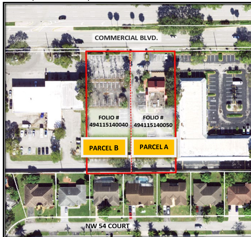
Figure 1, below, provides an aerial of the subject site located on the south side of West Commercial Blvd, approximately 1/4 mile east of N. University Drive.

Parcel A – Restaurant Site with Drive-Through (Proposed Renovation) (Folio #: 4941-15-14-0050)