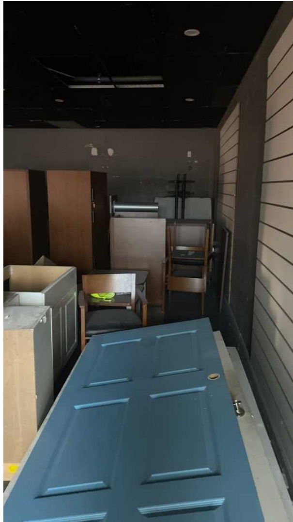
4 4-4-Feb 11 2026 11_30am-DvsD Date Taken: 2/11/2026

1520 S. Powerline Rd. Suite A Deerfield Beach, FL 33442 (954) 596-8989 Tel. - (954) 596-5155 Fax FL License # CGC1530721 - Fed ID # 84-1309171