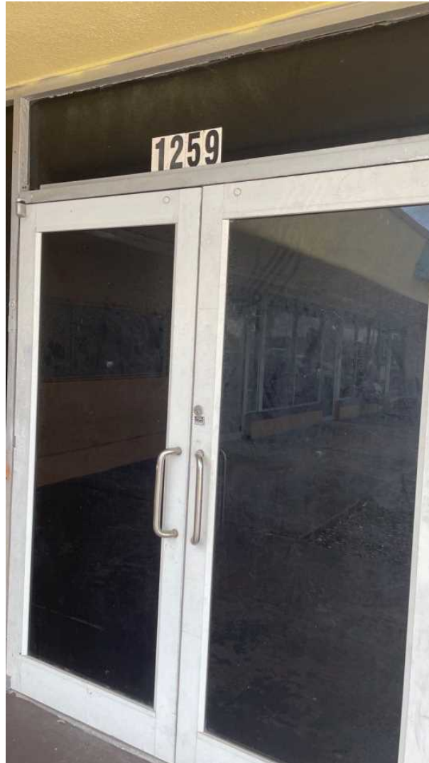
1 1-1-Feb 11 2026 11_28am-A6uR Date Taken: 2/11/2026

1520 S. Powerline Rd. Suite A Deerfield Beach, FL 33442 (954) 596-8989 Tel. - (954) 596-5155 Fax FL License # CGC1530721 - Fed ID # 84-1309171