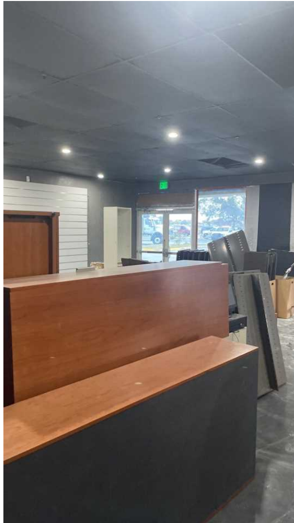
11 11-11-Feb 11 2026 11_32am-4yuo Date Taken: 2/11/2026

1520 S. Powerline Rd. Suite A Deerfield Beach, FL 33442 (954) 596-8989 Tel. - (954) 596-5155 Fax FL License # CGC1530721 - Fed ID # 84-1309171