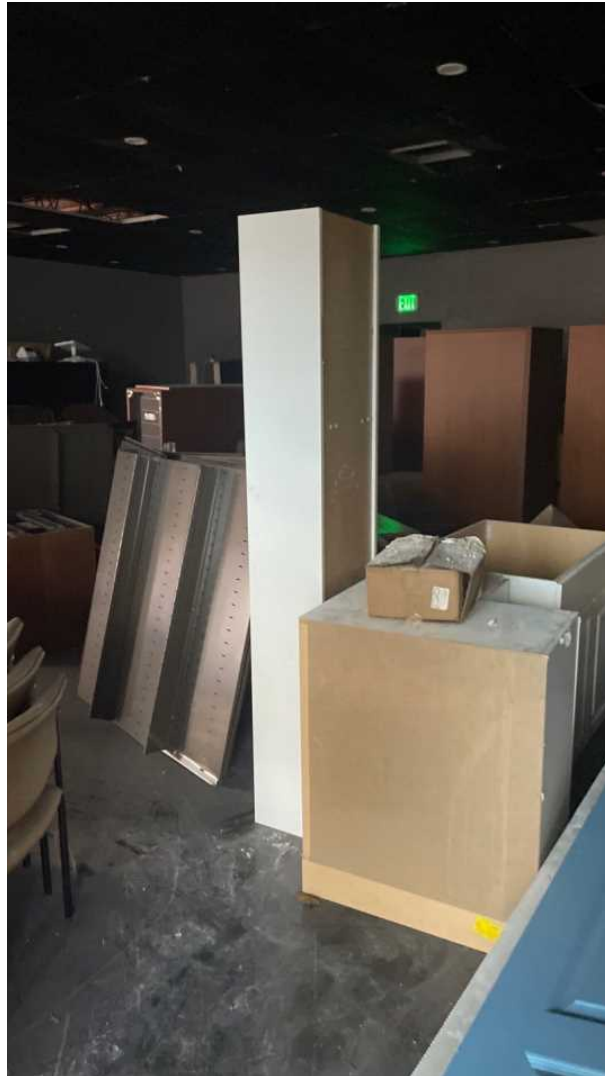
3 3-3-Feb 11 2026 11_30am-7VYA Date Taken: 2/11/2026

1520 S. Powerline Rd. Suite A Deerfield Beach, FL 33442 (954) 596-8989 Tel. - (954) 596-5155 Fax FL License # CGC1530721 - Fed ID # 84-1309171