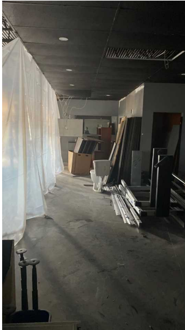
5 5-5-Feb 11 2026 11_30am-UG3E Date Taken: 2/11/2026

1520 S. Powerline Rd. Suite A Deerfield Beach, FL 33442 (954) 596-8989 Tel. - (954) 596-5155 Fax FL License # CGC1530721 - Fed ID # 84-1309171