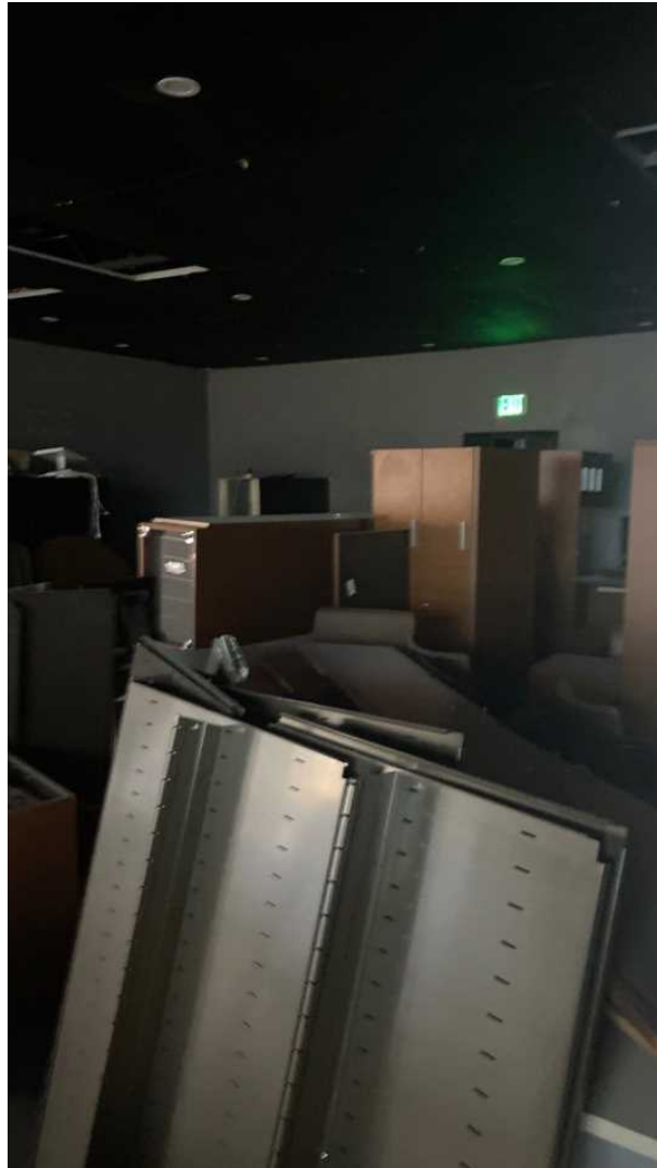
6 6-6-Feb 11 2026 11_30am-5tRj Date Taken: 2/11/2026

1520 S. Powerline Rd. Suite A Deerfield Beach, FL 33442 (954) 596-8989 Tel. - (954) 596-5155 Fax FL License # CGC1530721 - Fed ID # 84-1309171