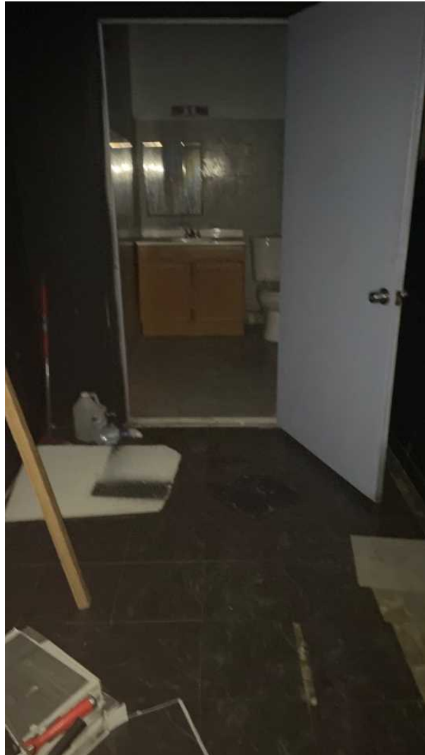
8 8-8-Feb 11 2026 11_31am-dRN8 Date Taken: 2/11/2026

1520 S. Powerline Rd. Suite A Deerfield Beach, FL 33442 (954) 596-8989 Tel. - (954) 596-5155 Fax FL License # CGC1530721 - Fed ID # 84-1309171