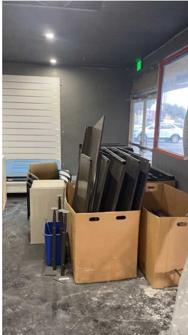
14 14-14-Feb 11 2026 11_32am-NsNk Date Taken: 2/11/2026

1520 S. Powerline Rd. Suite A Deerfield Beach, FL 33442 (954) 596-8989 Tel. - (954) 596-5155 Fax FL License # CGC1530721 - Fed ID # 84-1309171