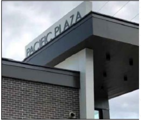
SIMILAR SIGN WALL EXAMPLE