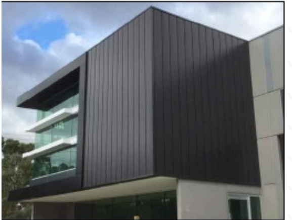
METAL SIDING EXAMPLE