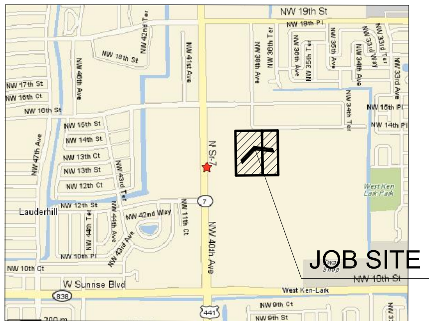
LOCATION MAP SCALE: N.T.S.

Containing 51,093 square feet more or less.