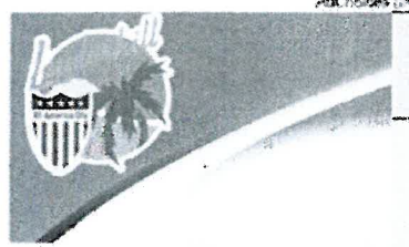
The requested p

Check out our Rates. Easy as 1-2-3. We are ready to lend $100-$1000! www.PayDayMax.com