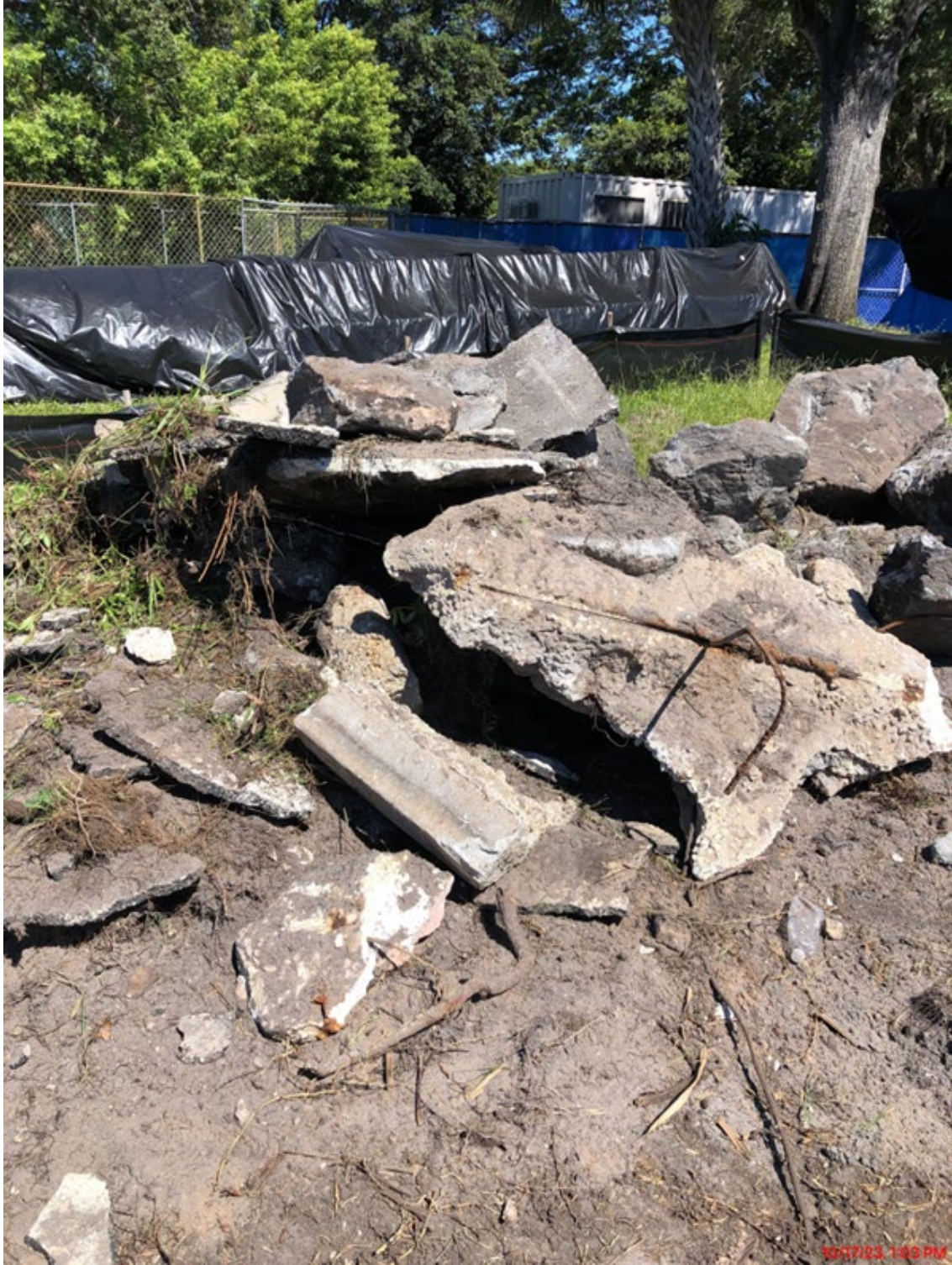
Concrete and Asphalt walks and debris