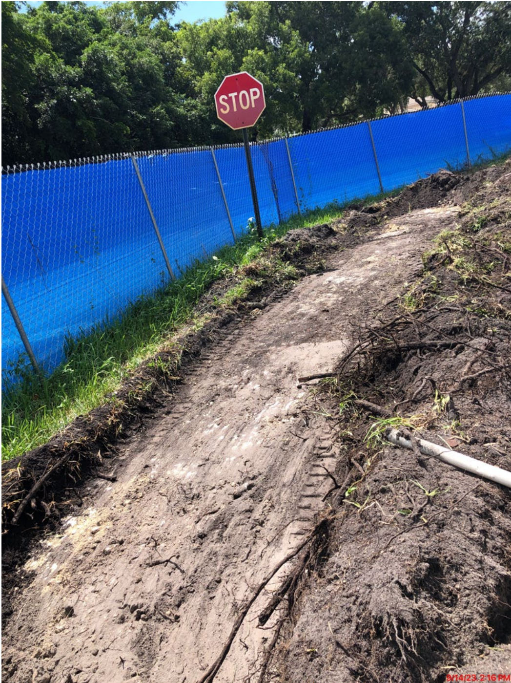
Sidewalk Removal - About 8' wide and 30' long