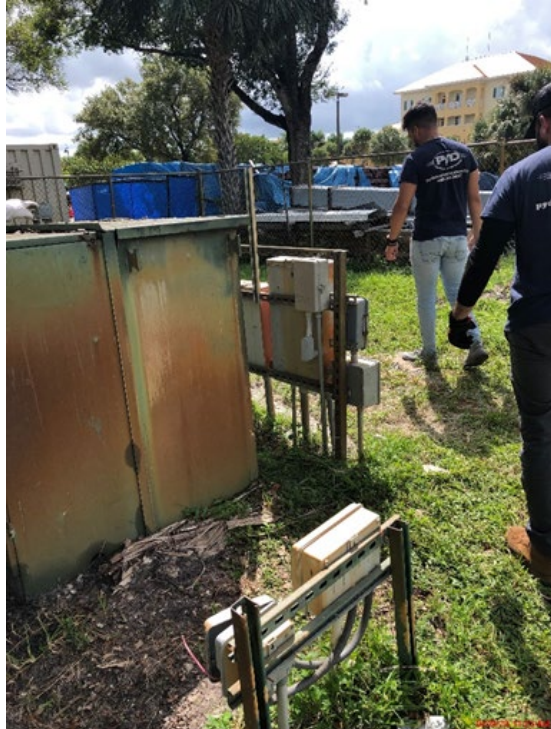
Red Paint Line By the Locate Service – Electrical Transformer & Panel