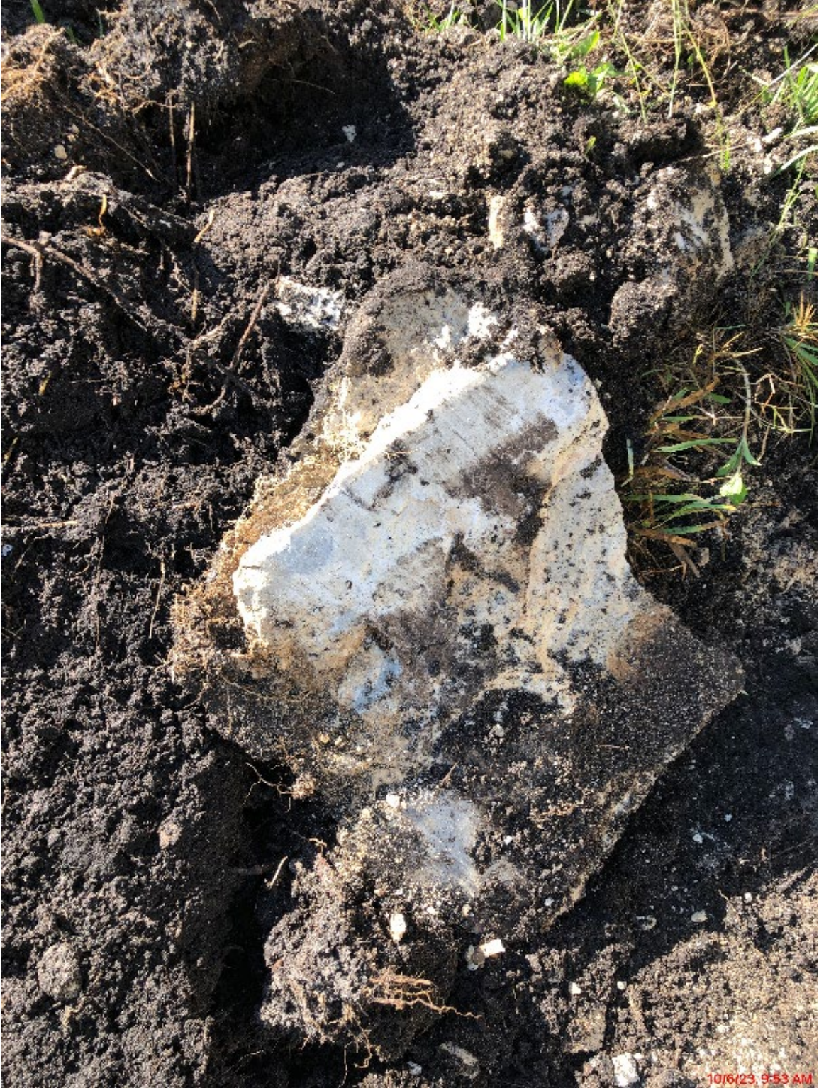
Concrete and Asphalt walks and debris