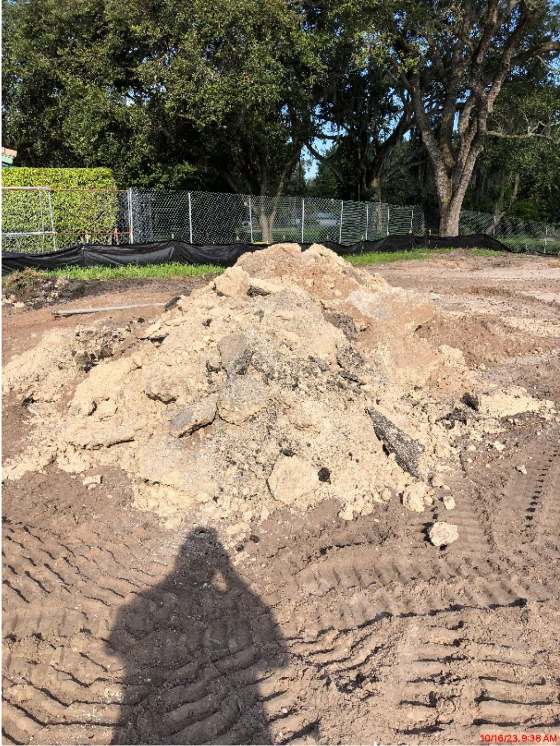
Concrete and Asphalt walks and debris