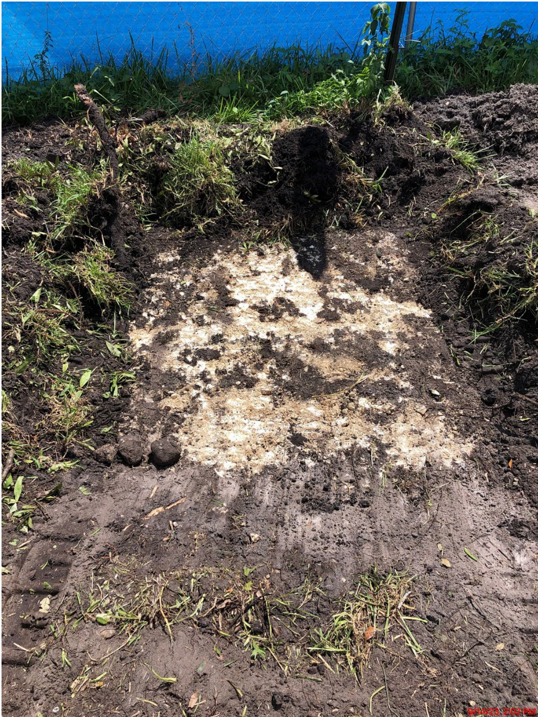
Sidewalk About 8' wide and 30' long Picture 2