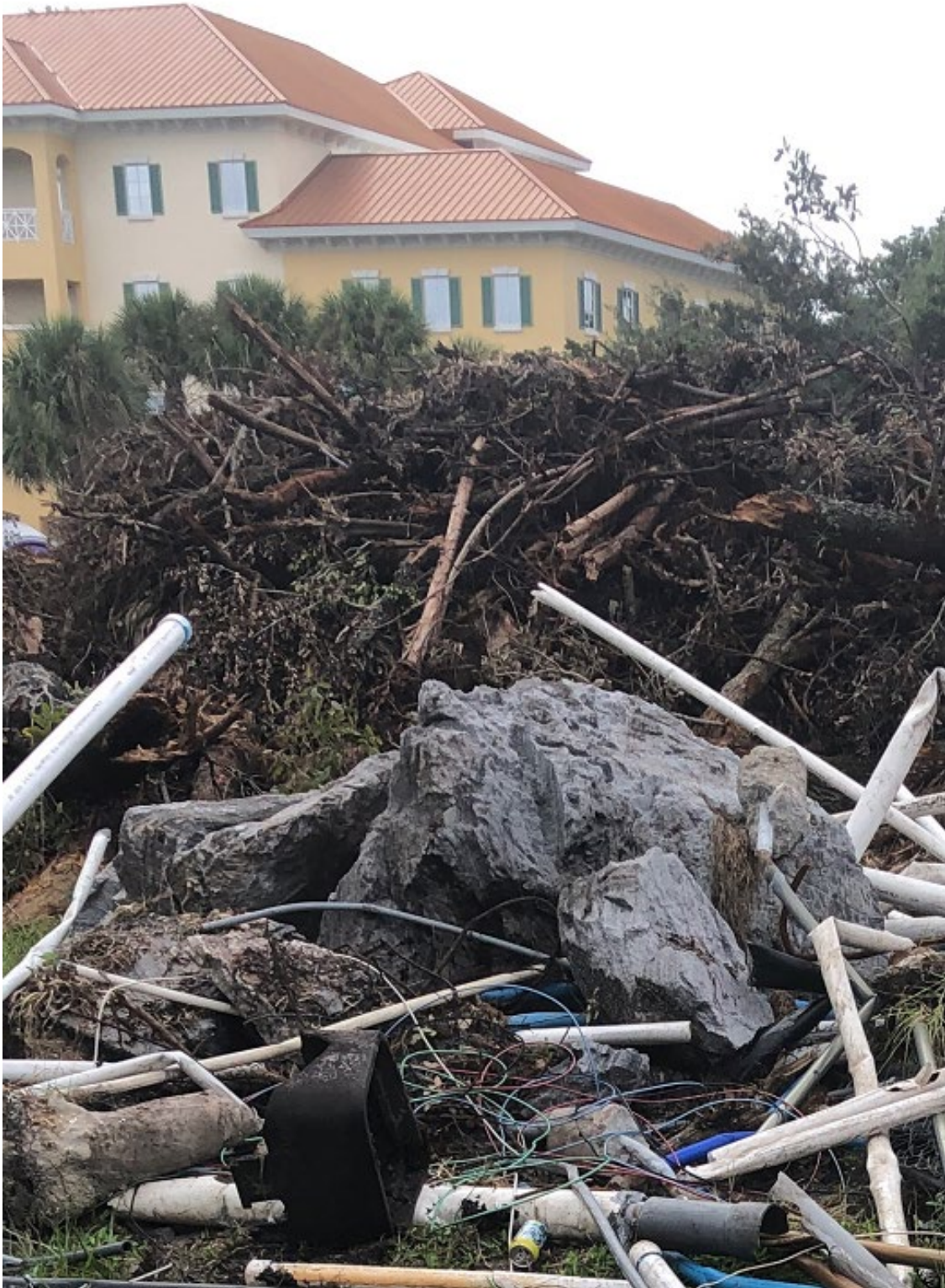
Man Made Aerated Concrete – Part of the remaining demolition debris.