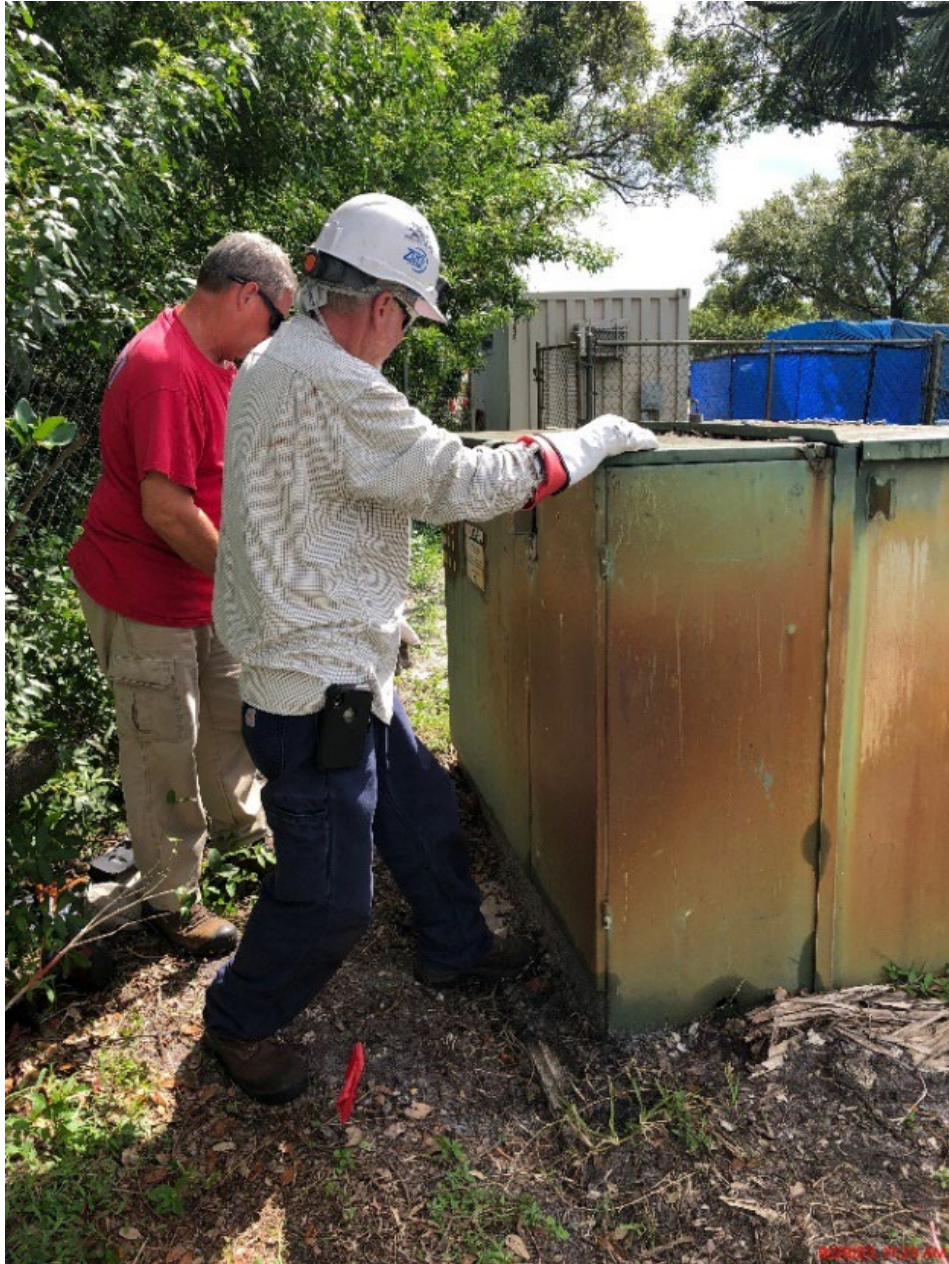
Three Seprarte meetings with FPL in order to Determine Line Output