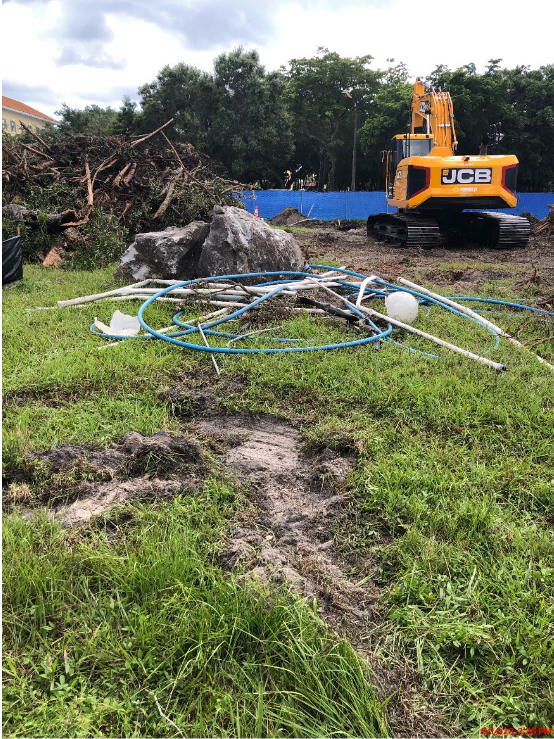
Man Made Aerated Concrete – Part of the remaining demolition debris, 2 nd Picture!