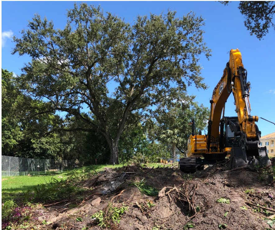
Stopped the Tree Removal of the final Tree