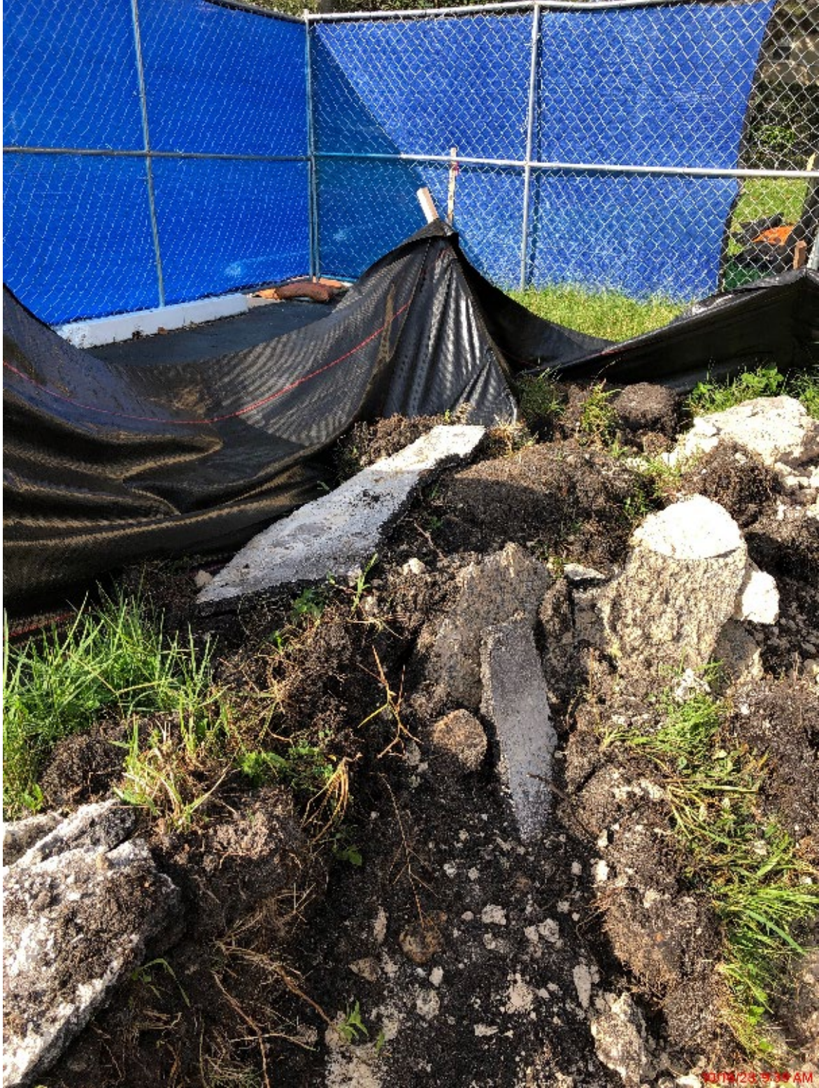
Asphalt Walkway Removed